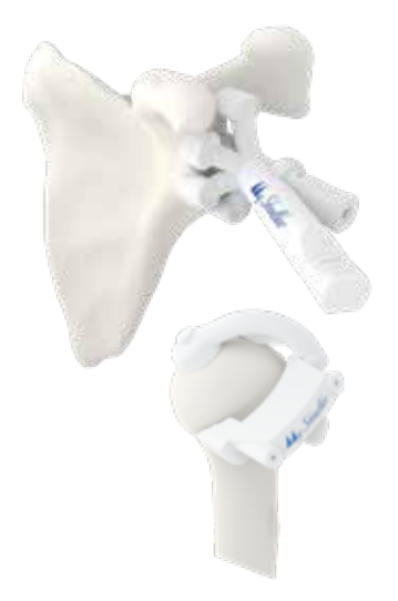
PATIENT MATCHED TECHNOLOGY IN SHOULDER SURGERY

The MyShoulder allows preparation of the bones to receive the prosthesis, respecting the characteristics of your anatomy.